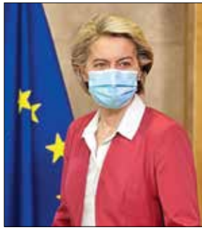
Ursula von der Leyen

BRUSSELS: The European Union has achieved a major goal of providing at least one coronavirus shot to 70 per cent of adults across the 27-nation bloc but member countries must step up their vaccination rates to combat fast-spreading variants of the disease, the EU's chief executive warned Tuesday.